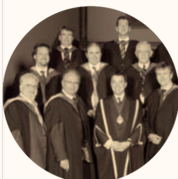
Recent Fellows of the Chartered Institute of Bankers in Scotland